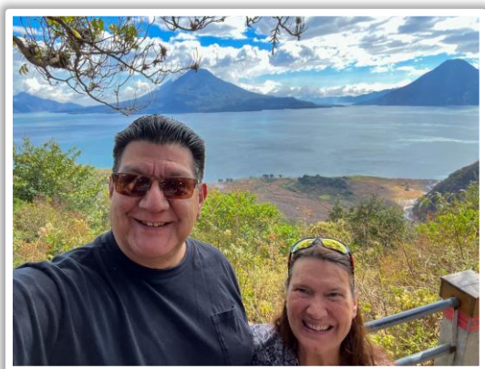
Starting the year off right! Engaging with boots-on-the-ground missionaries that serve the people of Guatemala in the stunning back drop of Lake Atitlan.