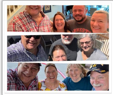
Grateful for the many happy faces & places...but eager to get back the Father's business. Next stop Guatemala!