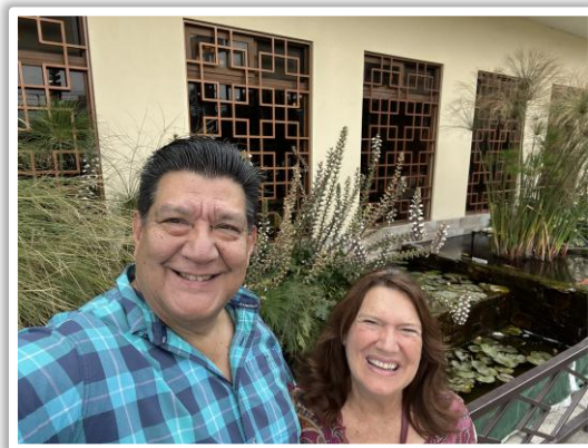
Woon-Kook, Guatemala Chinese food at its best!