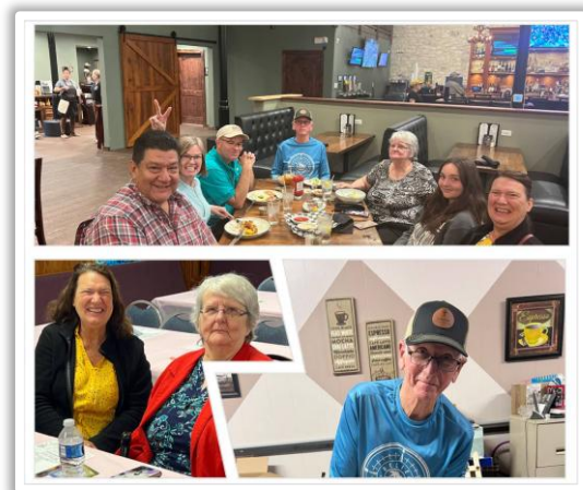
Spinning down with good friends from Refuge CMI in Goldthwaite Tx before returning to Guatemala

Our first afternoon back in our mission country we set about getting our household back up and running.....after lunch that is. Good to be home!